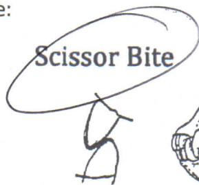
Position of 1,2, incisors